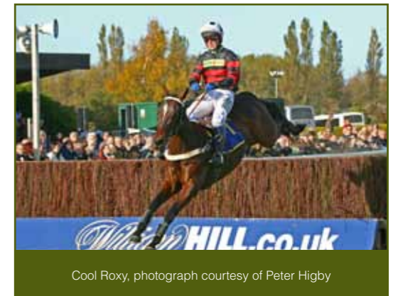
Cool Roxy