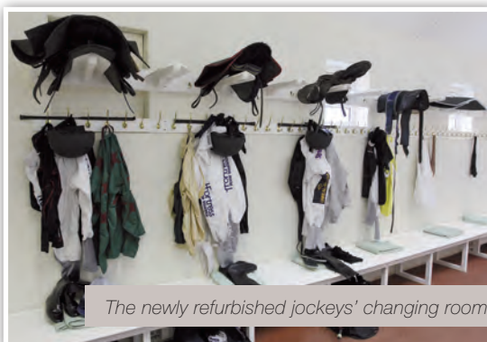
The newly refurbished jockeys' changing room

He finishes by saying: "It has been a frantic few months, but thanks to a lot of hard work from the builders and everyone else involved, the building was finished on time, and everything was in use (if not officially opened) for the first race meeting of the new season on 16 th October. We've done it!"