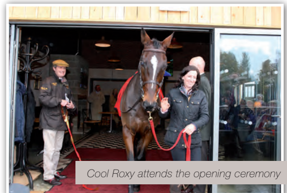
Cool Roxy attends the opening ceremony