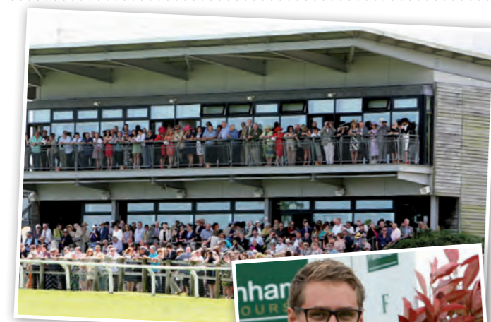
Best Dressed Couple